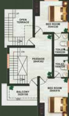
FIRST FLOOR AREA - 709 Sq.Ft