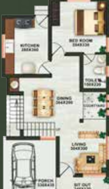
GROUND FLOOR AREA - 954 Sq.Ft