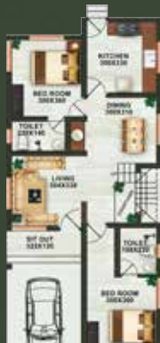
GROUND FLOOR AREA - 1151 Sq.Ft