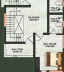
FIRST FLOOR AREA - 686 Sq.Ft