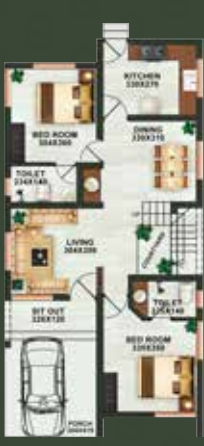
GROUND FLOOR AREA - 1126 Sq.Ft