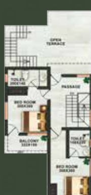
FIRST FLOOR AREA - 647 Sq.Ft