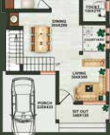
GROUND FLOOR AREA - 937 Sq.Ft