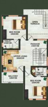
FIRST FLOOR AREA - 801 Sq.Ft